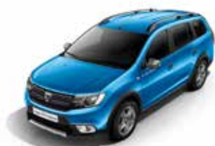
Azurite Blue (RPL)