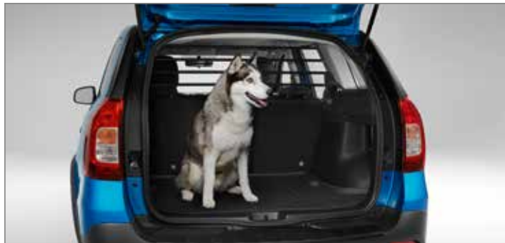
Pet Pack: All-in-one boot liner, Separation Grille, Dacia Foldable Dog Bowl