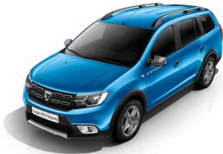
Stepway Lauréate in Azurite Blue

Dacia Logan MCV Stepway. Off-road spirit. Family-friendly.