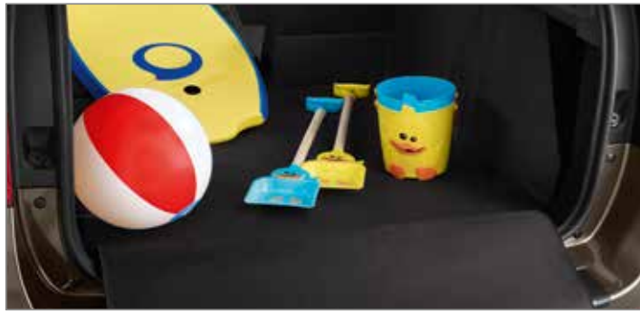
All-in-one boot liner