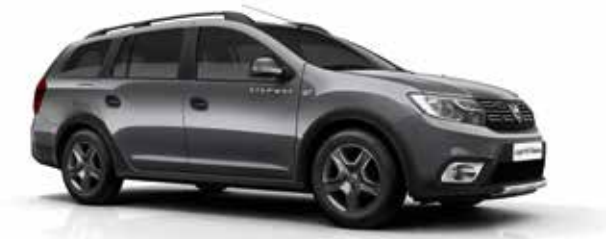
Nordic Grey (KPV)