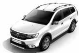
Glacier White (369)