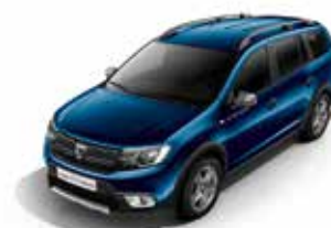
Cosmos Blue (RPR)