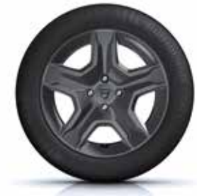
16" Dark Metal Flexwheel