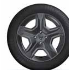
16" Dark Metal flexwheel