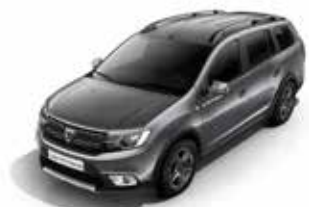
Nordic Grey (KPV)