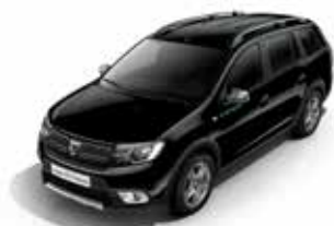
Pearl Black (676)