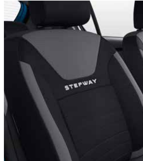
Dark carbon 'Stepway' cloth upholstery