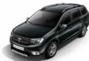
Slate Grey (KNA)