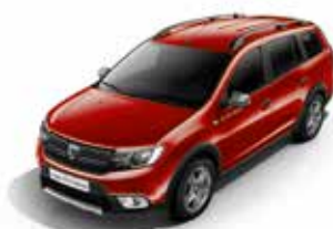
Cinder Red (B76)