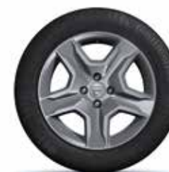
16" 'Stepway' design wheels