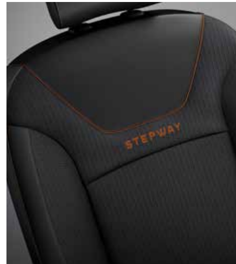
Exclusive 'Stepway' orange trim upholstery