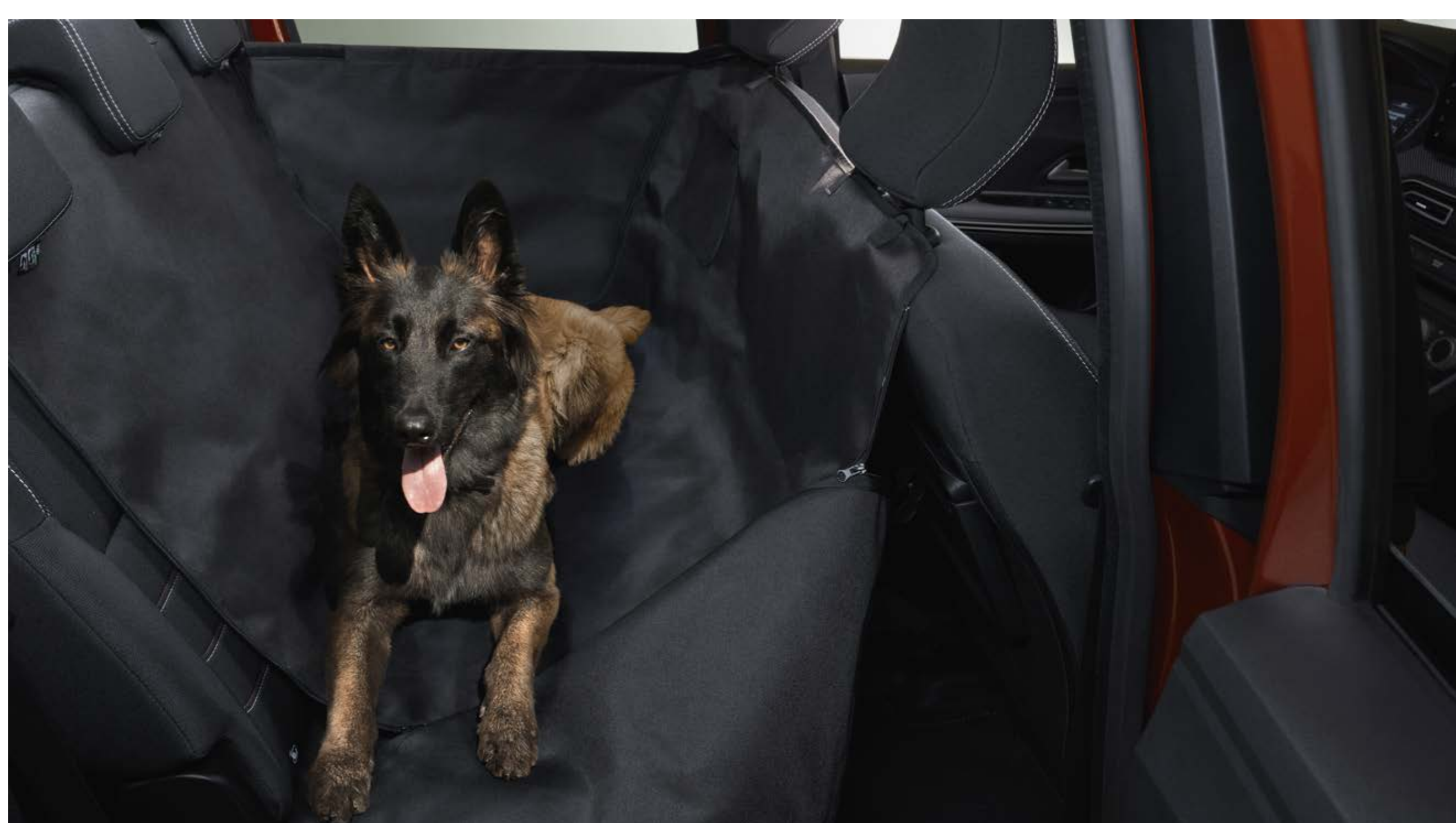
REAR SEAT PROTECTOR 7711945735