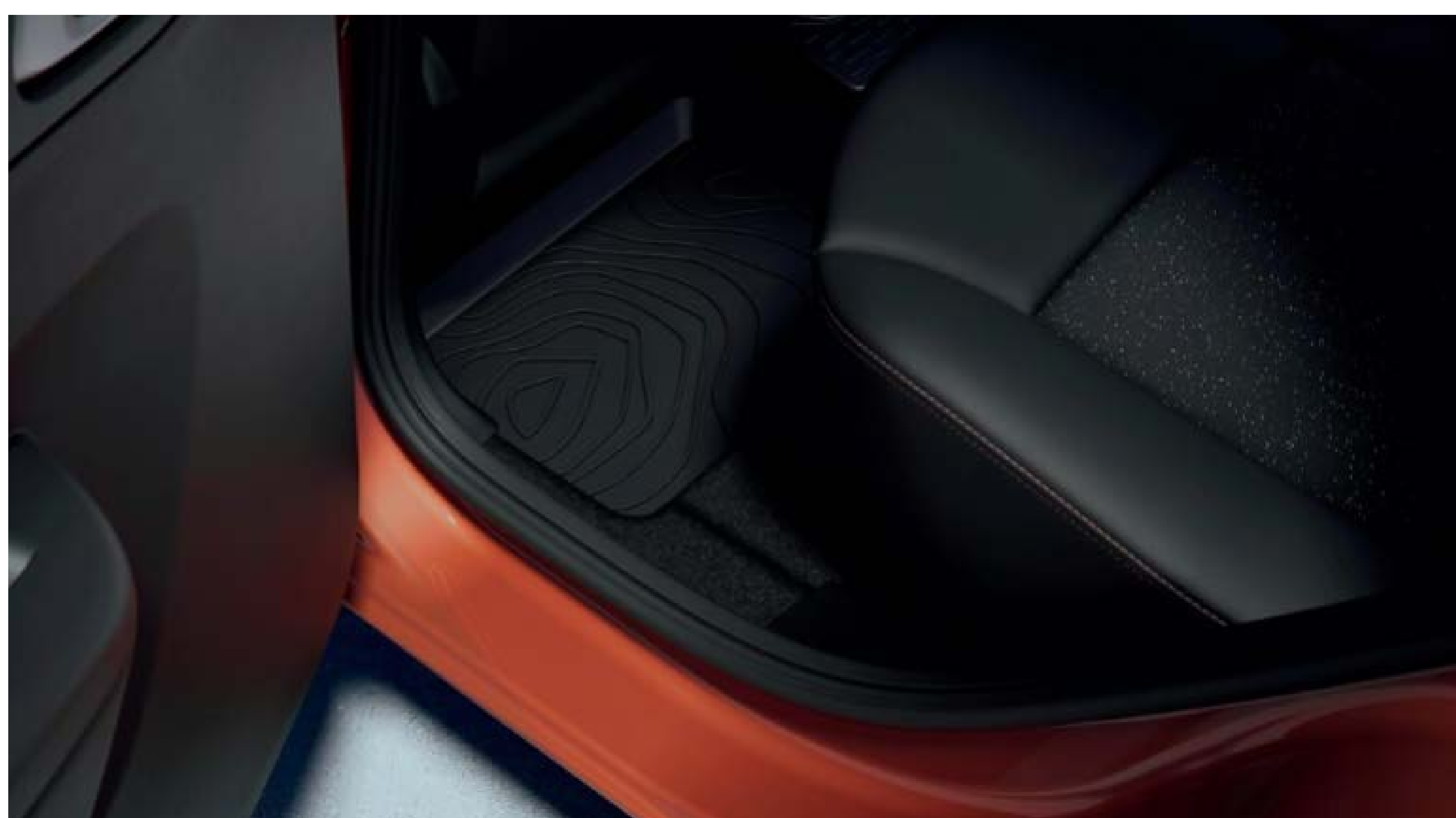
RUBBER MATS FOR REAR 749M60974R