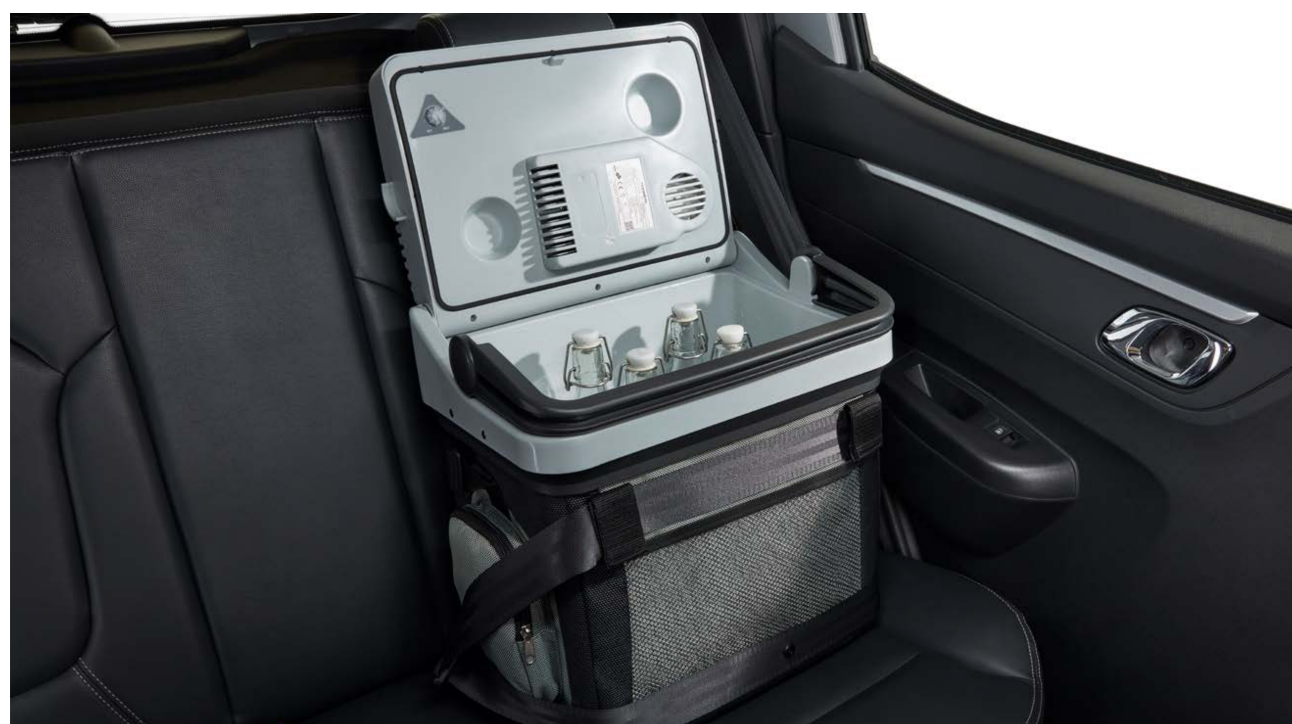
COOL BOX 7711431405