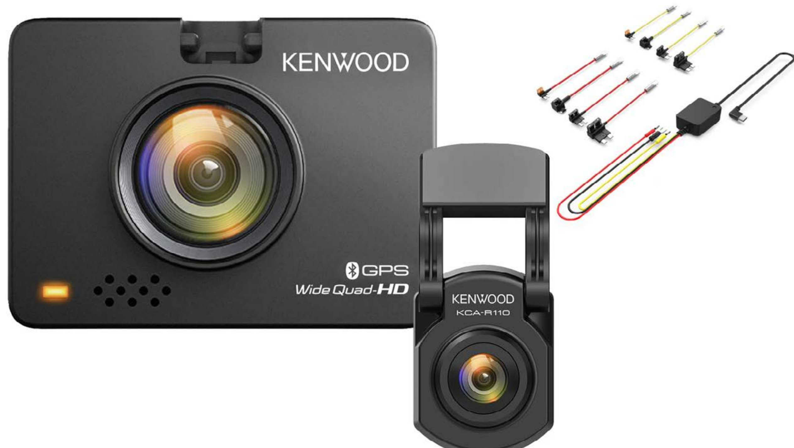
DASHCAM Front and rear dashcam 7717086531