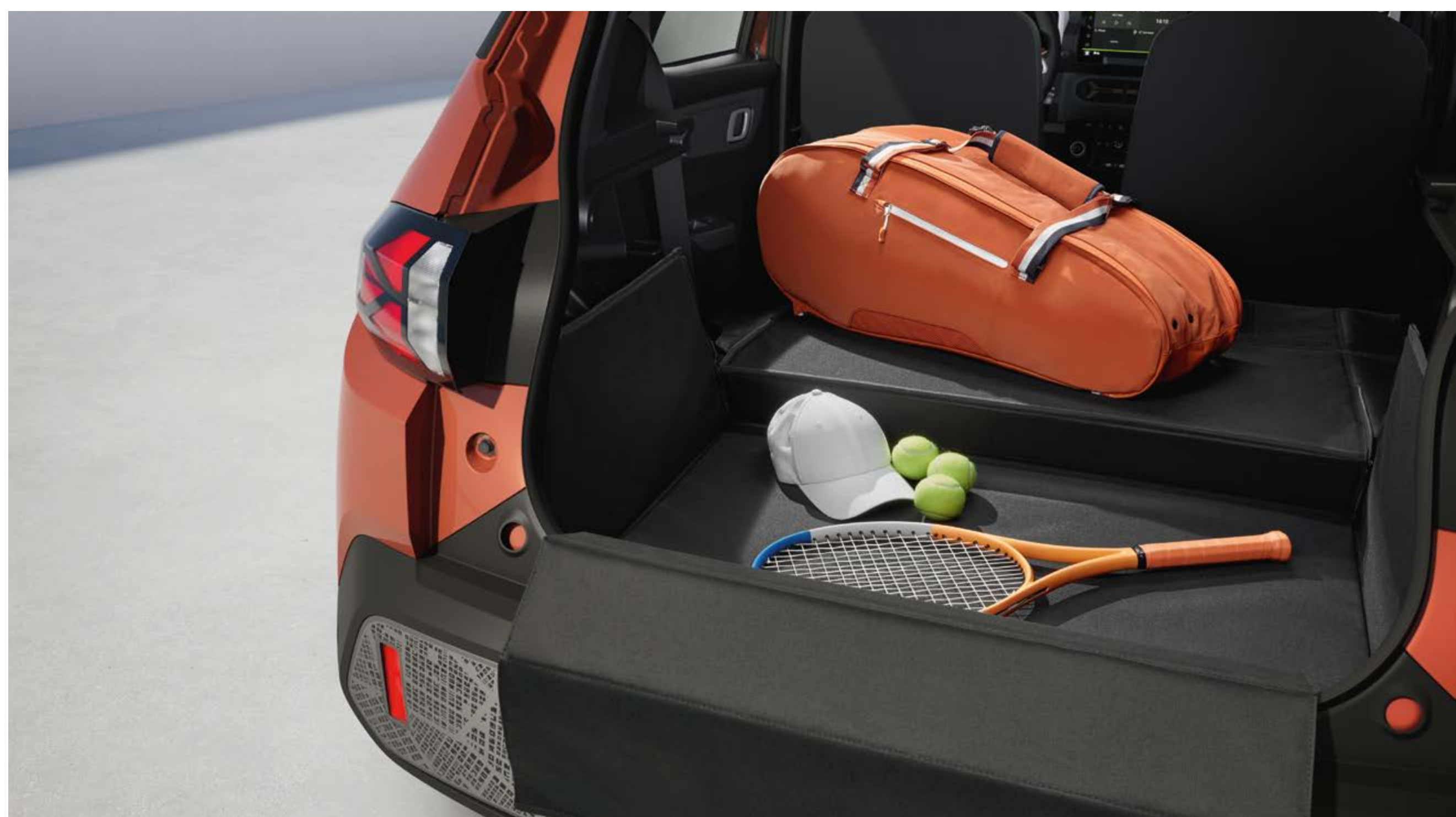
EASYFLEX ALL-IN-ONE BOOT LINER 8201740602