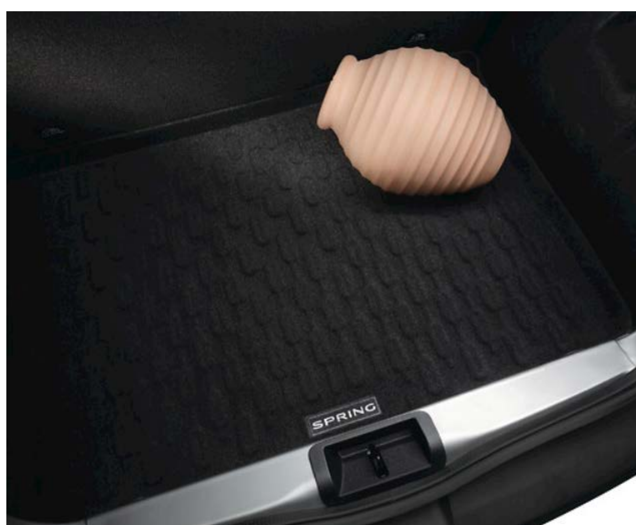
PREMIUM DELIVERY PACK Premium textile mats 8201751534 Safety kit 7711780759 Key card wallet 7717094928