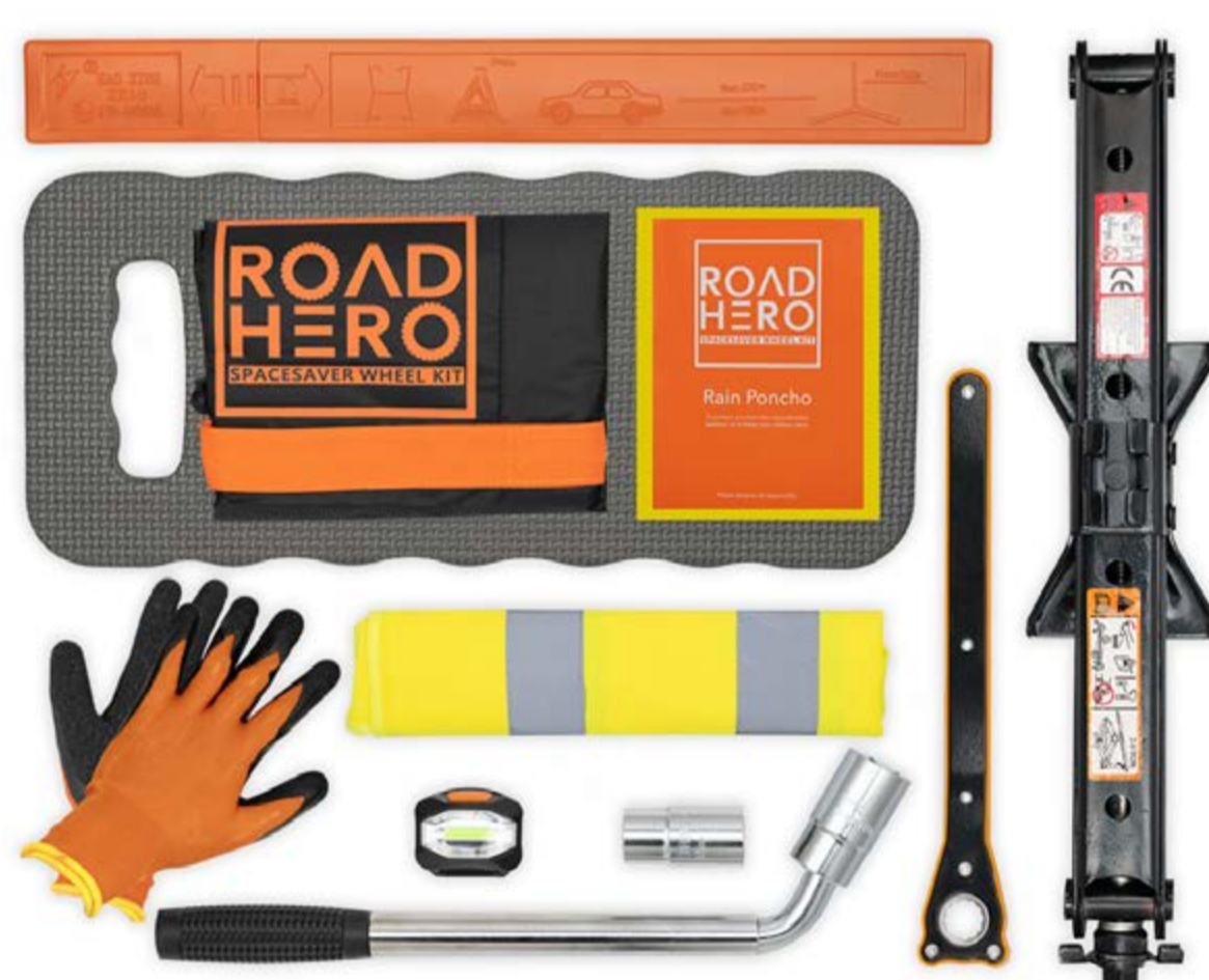
SPARE WHEEL KIT Spare wheel 7717094875 Kit 7717085170