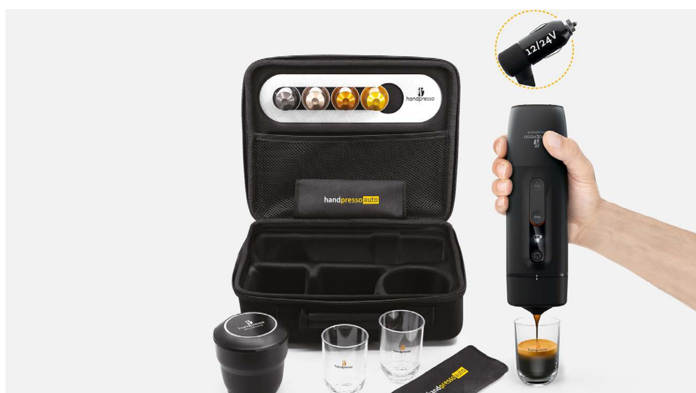
HANDPRESSO PORTABLE COFFEE MACHINE 7711940552

Keep your food and drinks at the right temperature whatever the season. Easy to carry, take the cool box with you wherever you go: picnics, afternoons at the beach, etc. Capacity: 24 L.