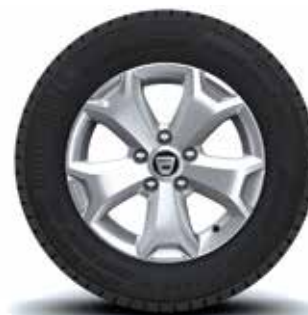
16" 'CYCLADE' ALLOY WHEEL