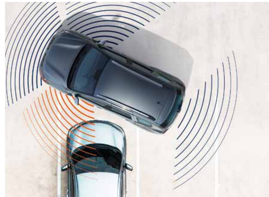
MULTIVIEW CAMERA ^