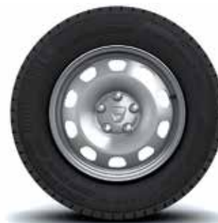
16" STEEL WHEEL