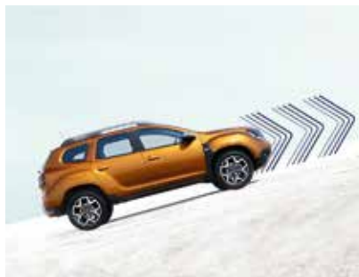
HILL START ASSIST

Hill Start Assist makes light work of the steepest slopes, while the Hill Descent Control* keeps you on top of your speed. And because your eyes can't be in two places at once. The multiview camera detects objects around you. Talk about smooth sailing.