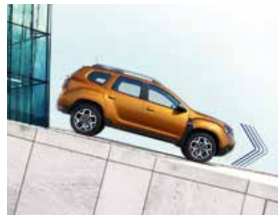
HILL DESCENT CONTROL*