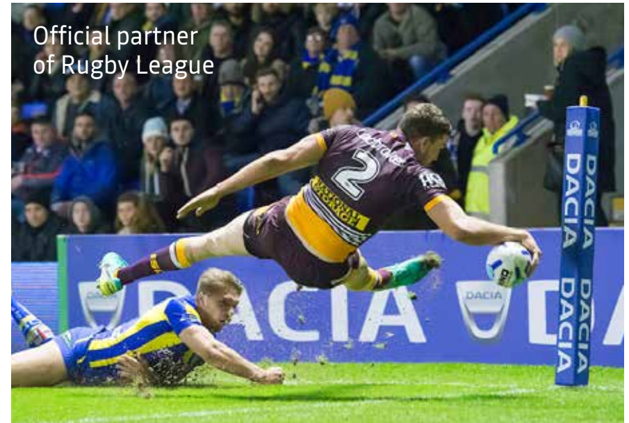
Official partner of Rugby League