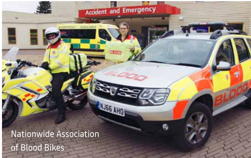
Nationwide Association of Blood Bikes

For us, going the extra mile doesn't stop at making great value cars. We take great pride in playing an active part in the community and giving back to communities throughout the UK. We support the life-saving work of the Nationwide Association of Blood Bikes . We get stuck in as the official partner of Rugby League . Now the proud sponsors of the Nation England Rugby League teams for Men, Women, Wheelchair and Youth. We also run Dacia Days , which are full of fun and games for our amazing Dacia drivers - keep an eye out for the next event! In the meantime, keep up with us on our Facebook page, Youtube Channel or Instagram.